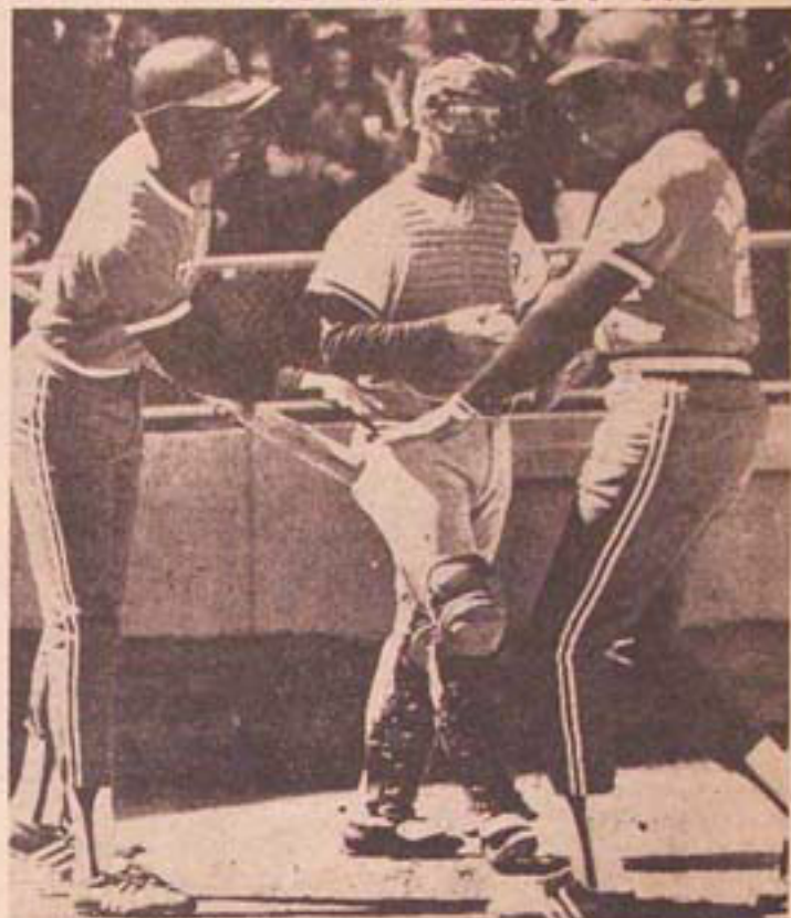
FRANK ROBINSON (right) is congratulated on his home run.