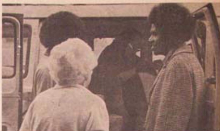
The Black Panther Party's S.A.F.E. Program provides free transportation for senior citizens.