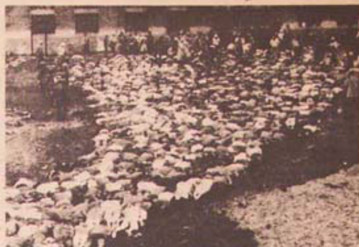
Attica inmates were severely tortured and brutalized by police following prison's retaking.