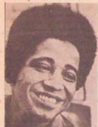
GEORGE JACKSON, fallen Field Marshal of the Black Panther Party.

The verdict ended the first phase of a civil rights trial which began last March 24 with a $1.2 million suit filed by the inmates' relatives. The next phase will be to determine the amount of the damages to be awarded the families. A court date has been set for April 21.