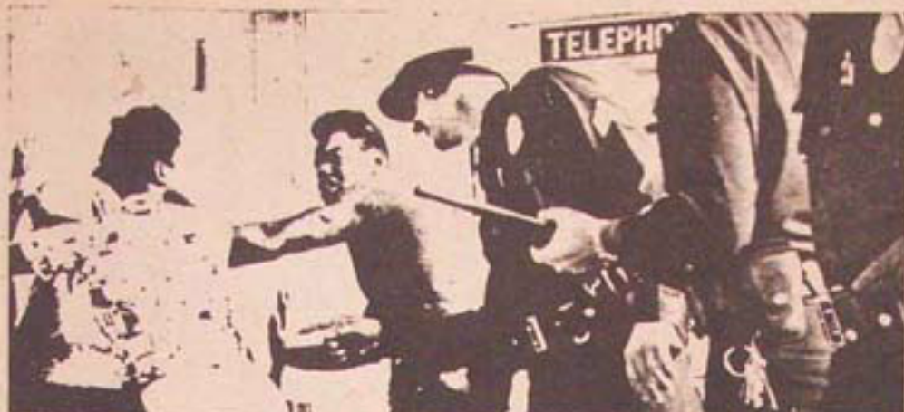
Police brutality in the U.S. is directed primarily at the Black community, particularly against young Black men.