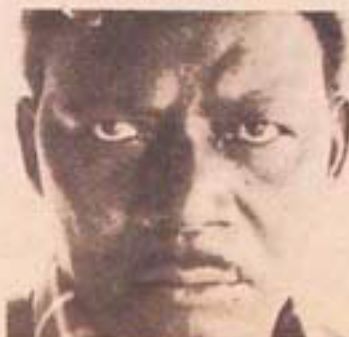
Slain ZANU leader HERBERT CHITEPO.

Herbert Chitepo, an aide and a small child were killed instantly when a bomb planted in his driveway outside his house exploded as he drove his car over it. Africa News reports that observers in Lusaka, Zambia, believe it was the increased