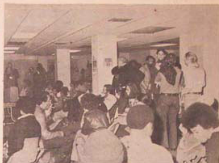
Scene at Elaine's campaign headquarters on election night.

And, even if the special code was provided, for the first time, precincts were tabulated for broad cross sections of the city,